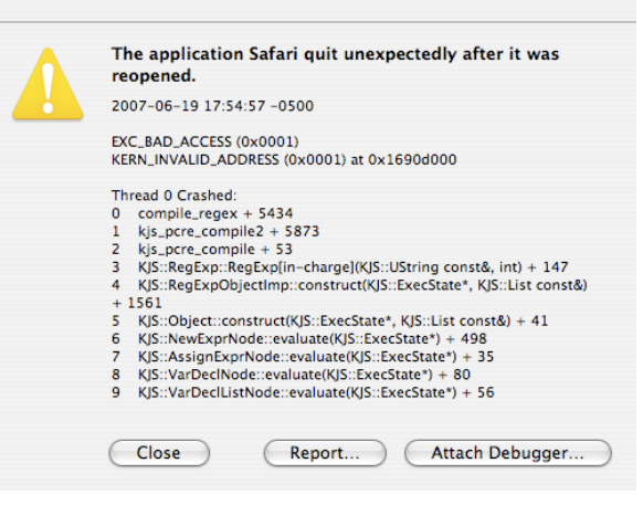
Figure 3: Developer information incorporated into CrashReporter

CrashReporter can be configured using CrashReporterPrefs application to allow the option to attach to the process with GDB after it crashes, see Figure 3. Also, note that this will run the commands from your .gdbinit file, too.